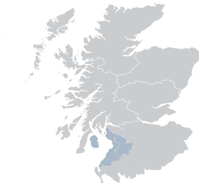
Map 1 Ayrshire and Arran

© Crown copyright and database right (2014). All rights reserved. Ordnance Survey Licence number [100021242]